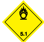
Class 5.1 HAZARD Oxidizing Substances

ADR , Annex A General provisions and provisions concerning dangerous substances and articles; Classification; Class Specific Provisions